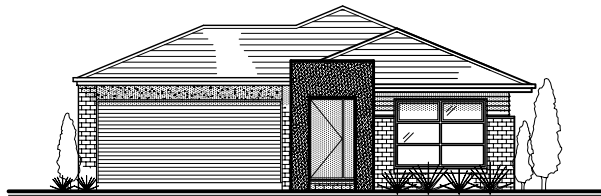
THE RIO - COASTAL (ADD $1 440)