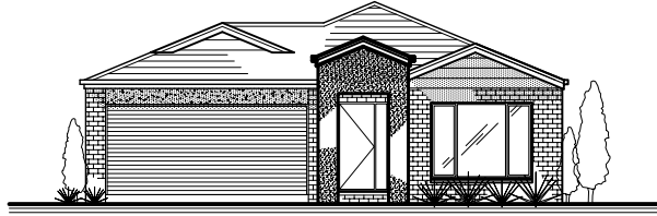
THE RIO - CONTEMPORARY (INCULDED)