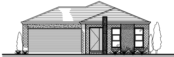
THE RIO - URBAN (INCULDED)