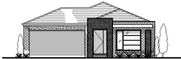
THE RIO - COSMO (ADD $1 820)