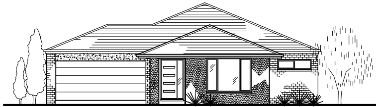
PALM - CONTEMPORARY