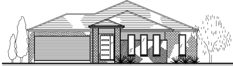
PALM - COASTAL