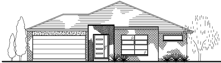
PALM - COSMO