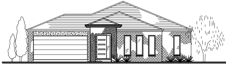
PALM - CLASSIQUE